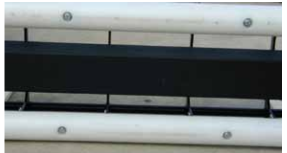
Durable UHMW skid guards and steel ribbed cage protects aluminum housing from damage when crossing rough terrain