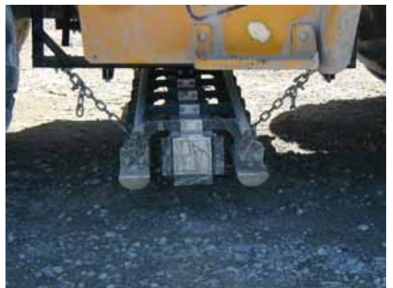
Easily attaches to equipment you already use