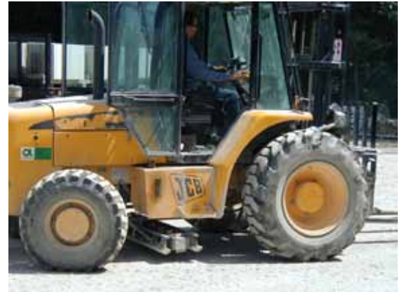
Extend the working power of your current equipment and do two jobs at the same time