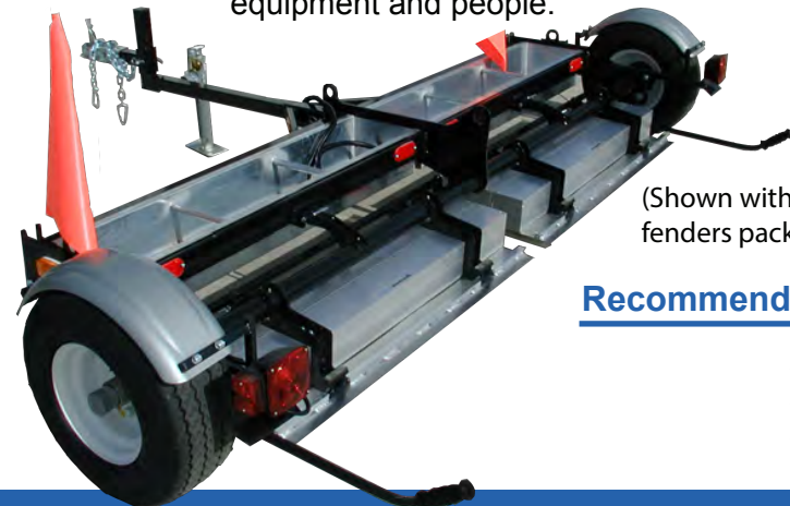
(Shown with optional lights and fenders package)