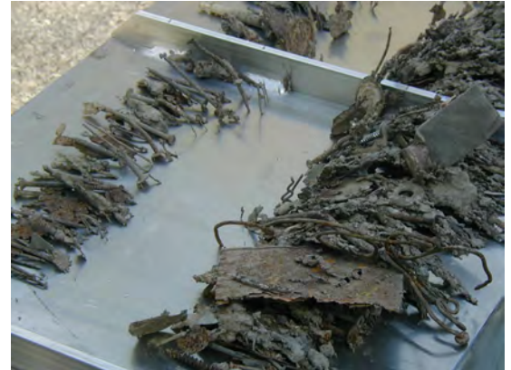
Pick up ferrous metal debris from large areas quickly and easily