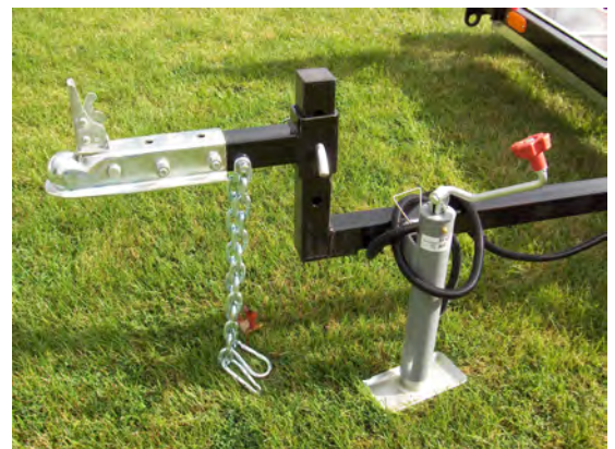
Adjustable coupler height