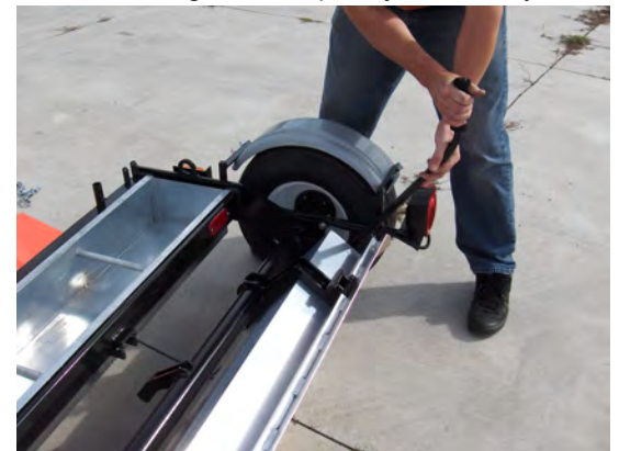
Unique Slingjaw clean off system stores debris for later removal