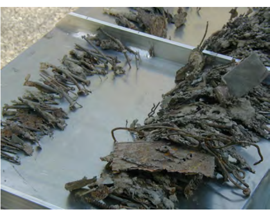
Pick up ferrous metal debris from large areas quickly and easily