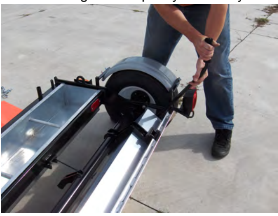
Unique Slingjaw clean off system stores debris for later removal