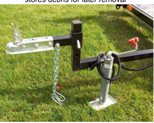
Adjustable coupler height