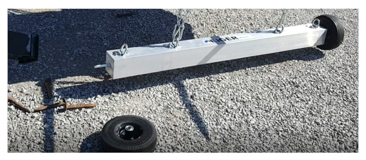
Dispose of or Recycle removed Metal Debris..