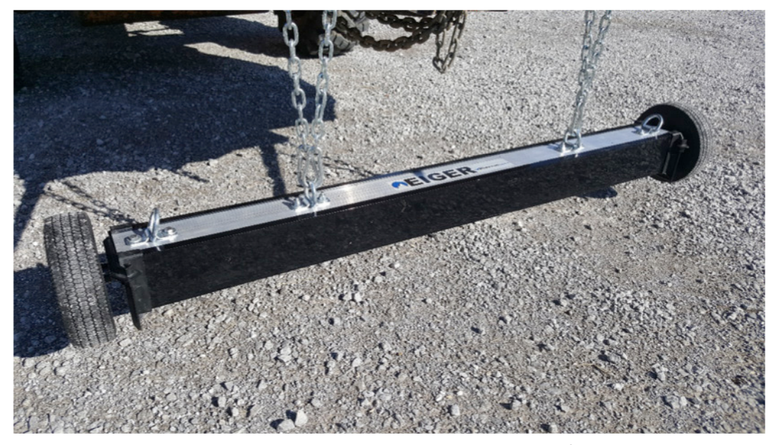
Reinstall the previously removed PVC Quick Clean Off Sleeve, Wheel, Wheel Clip and Sleeve Retainer Clip.