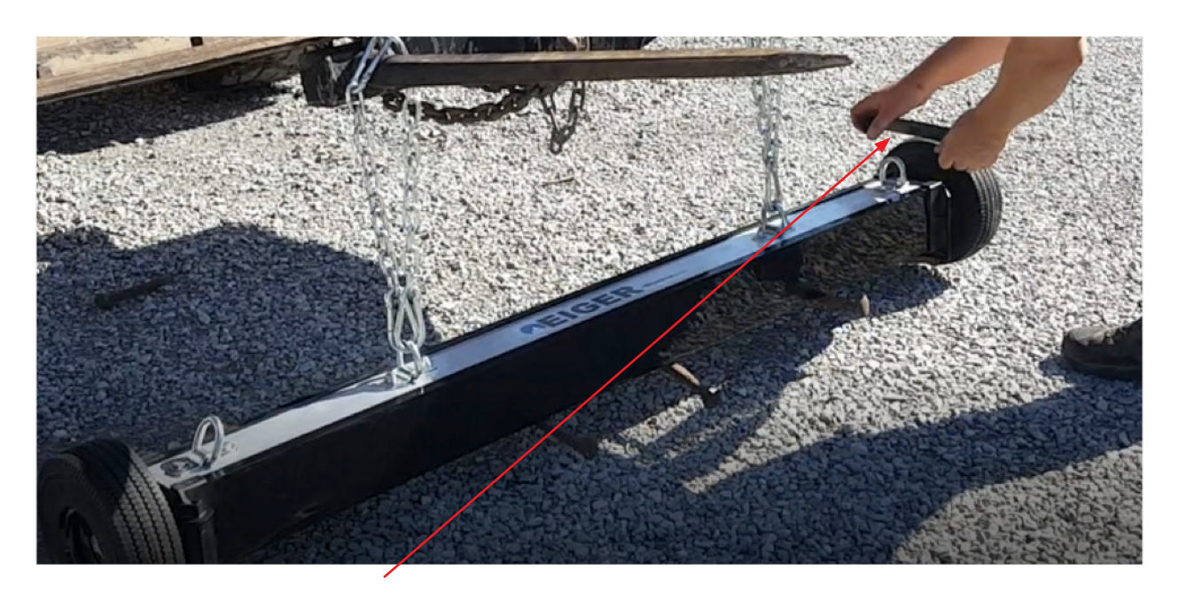
When it's time to clean the magnet off remove the Sleeve Retainer Clip from the opposite end that you want to discharge the metal debris from.