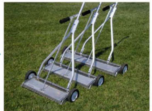
Available in three convenient sweeper widths