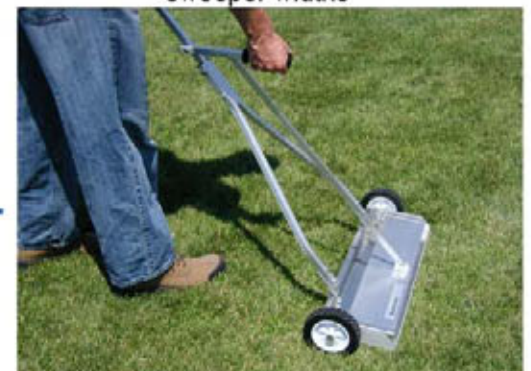
Debris release handle - remove debris from sweeper without lifting or bending over