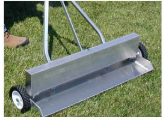
Easy debris release. When magnetic block is lifted and separated from bottom tray - debris drops to the ground